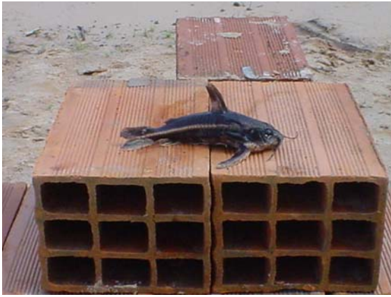
Fig. 1 Blocks used to simulate rocky patch habitat. The fish is a 14 cm (SL) Platydoras sp. catfish. Each hole in the bricks is 3 \times 5 cm

variation of species composition in a similar floodplain river system can be found in Arrington and Winemiller (2006).